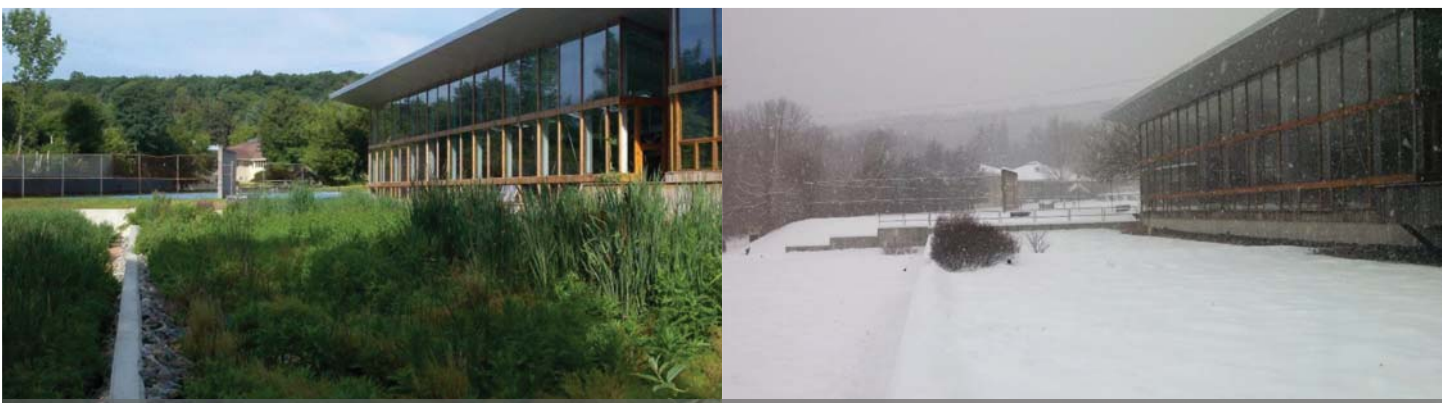
The constructed wetlands at the Omega Center for Sustainable Living in summer and winter

Strategies to address these challenges may include increasing treatment area, insulating from heat loss, deepening installation for freeze protection, and/or recirculating the water to keep it from freezing.