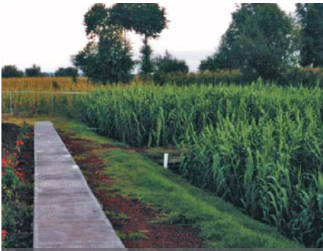
Biohabitats-designed reed beds with giant cane