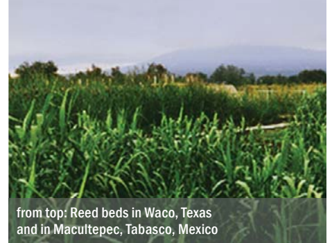
from top: Reed beds in Waco, Texas and in Macultepec, Tabasco, Mexico