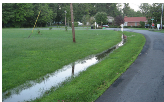
top: Map of potential retrofit locations bottom: Opportunities for conservation landscaping and swale retrofits along Creek Drive

Through an effort funded by the National Fish and Wildlife Foundation, Biohabitats developed recommendations for natural drainage retrofits and habitat enhancements for Oyster Harbor, a community located on Annapolis Neck in Anne Arundel County, Maryland. Oyster Harbor faces a number of common yet challenging management issues related to conveyance and treatment of runoff within the roadway right-of-way and on private lots. Oyster Harbor's location on the Chesapeake Bay