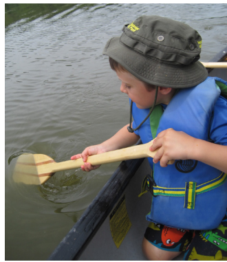
top: Stormwater swale design

Biohabitats helped the Passaic Valley Sewerage Commission (PVSC) restore the Passaic River and its watershed, and bring to life an envisioned Passaic River Blueway, a 76-mile canoe and kayak trail spanning Newark Bay. Working alongside the PVSC and local communities, Biohabitats designed six of the trail's 30 planned access points in such a way that they provide